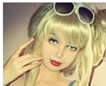
16-Year-Old 'Human Barbie' Is the Most Jaw-Dropping Yet (PHOTOS) Stirring Daily