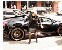
Broke and Famous. 15 Stars That Lost It All. She Budgets