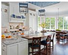
Goodbye Granite, Hello To Fresh High-End Countertop Alternatives HGTV