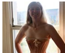
One Woman Wore a Corset Every Day...and This is What Happened You Beauty